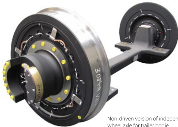
Non-driven version of independent wheel axle for trailer bogie application